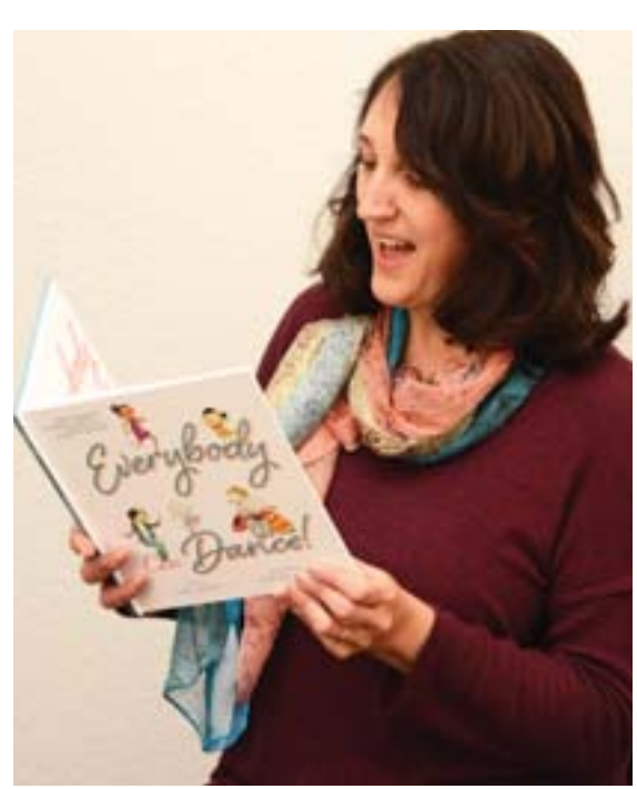
Local author reads her book